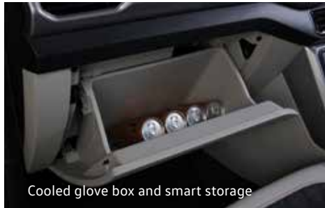
Cooled glove box and smart storage