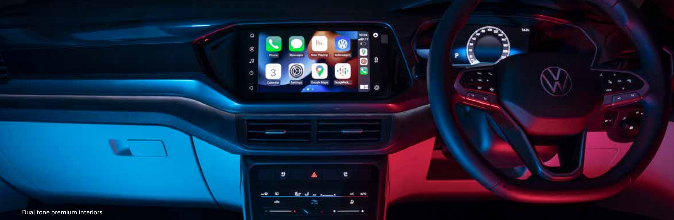
Dual tone premium interiors