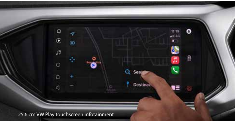
25.6 cm VW Play touchscreen infotainment

When it comes to technology, the Taigun is one step ahead. With the largest-in-segment 20.32 cm Digital cockpit, the Taigun always gives you an insight about your driving style. While the 25.6 cm VW Play touchscreen infotainment ensures that you stay connected to the hustle.