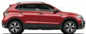
Wild Cherry Red