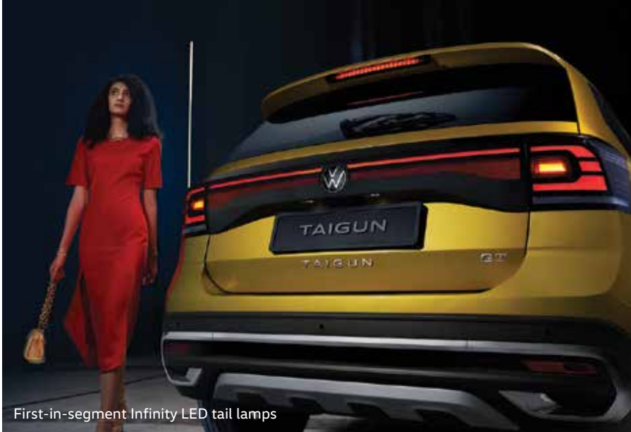
First-in-segment Infinity LED tail lamps