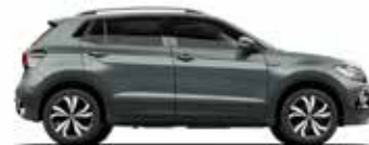
Carbon Steel Grey