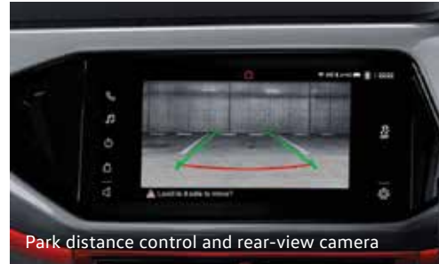
Park distance control and rear-view camera