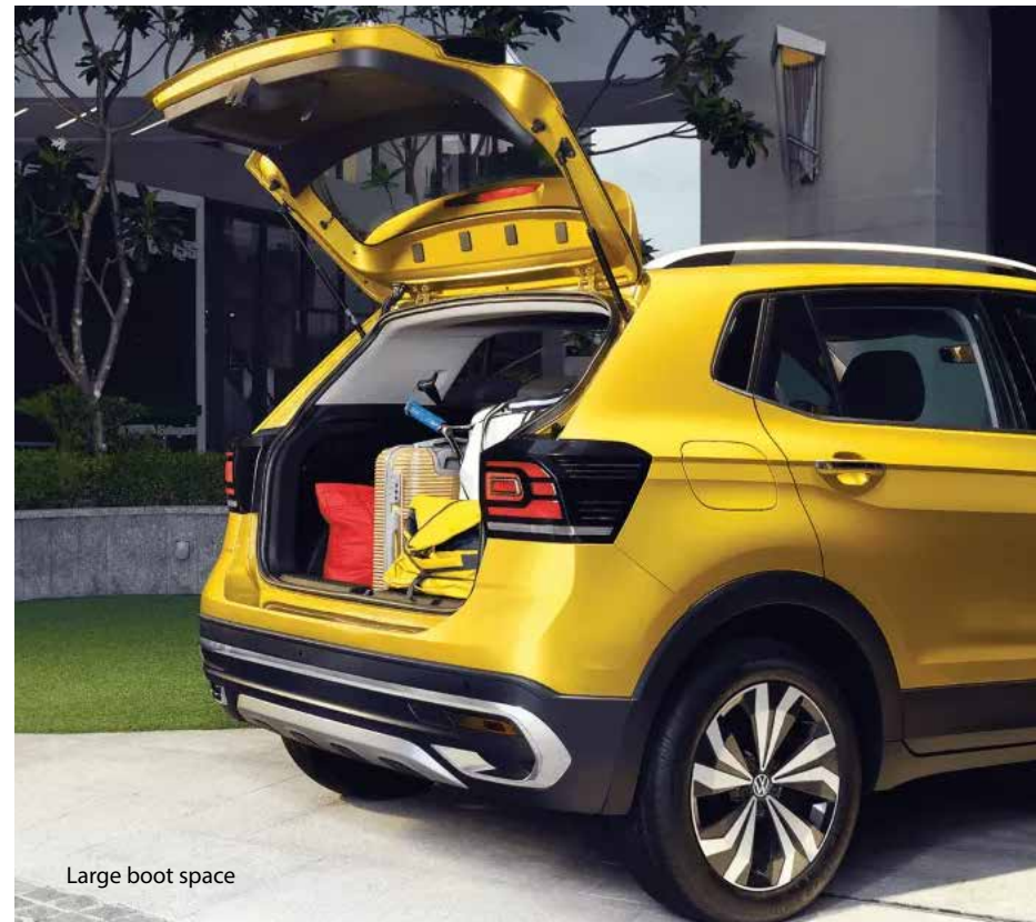
Large boot space

Once inside, the Taigun sets the mood for your hustle, with its sporty ambient lighting. The Dual tone premium interiors are designed by and for those with an eye for detail. The carbon finish complements the sporty look, while the massive boot space lets you accommodate a lot more in your everyday hustle.