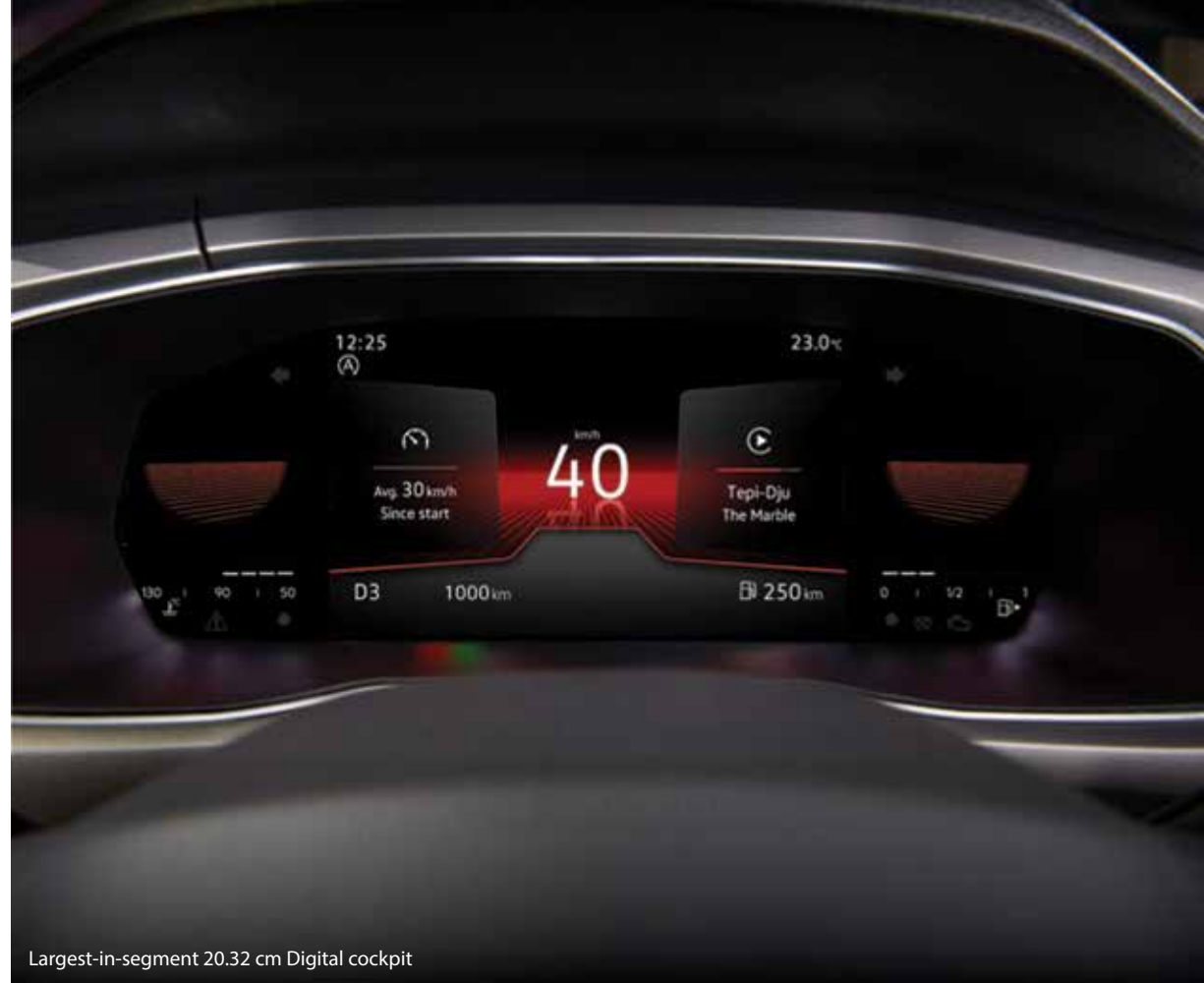
Largest-in-segment 20.32 cm Digital cockpit