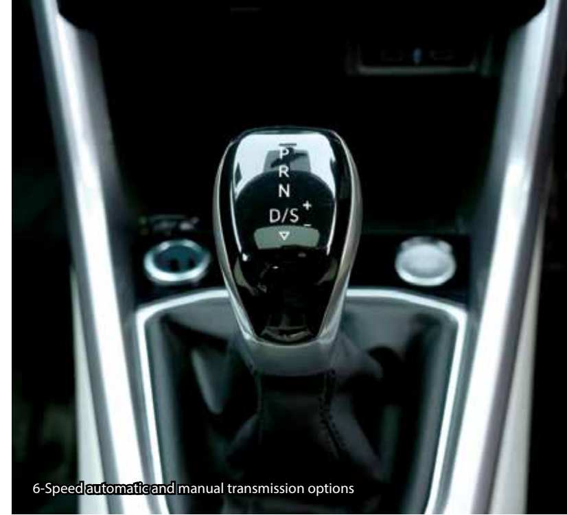
6-Speed automatic and manual transmission options