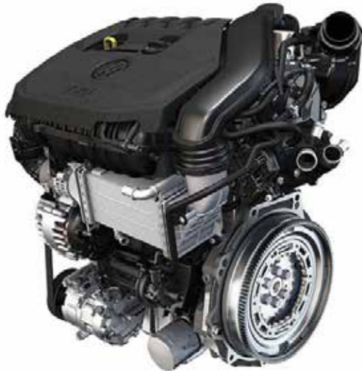
1.0 TSI engine

The thrill of hustle is in the chase of perfection. With the revolutionary TSI engine at its heart, the Taigun brings to the race, unabashed power combined with thoughtful efficiency. The 1.0 TSI engine available with manual and automatic transmission options, and lets you pick the best combination to set the pace for every chase. The Cassino alloy wheels provide that edge to complement the Taigun's performance.