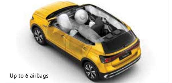
Up to 6 airbags