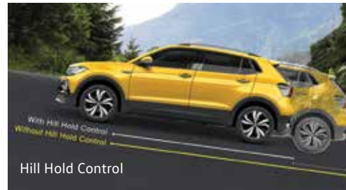
Hill Hold Control