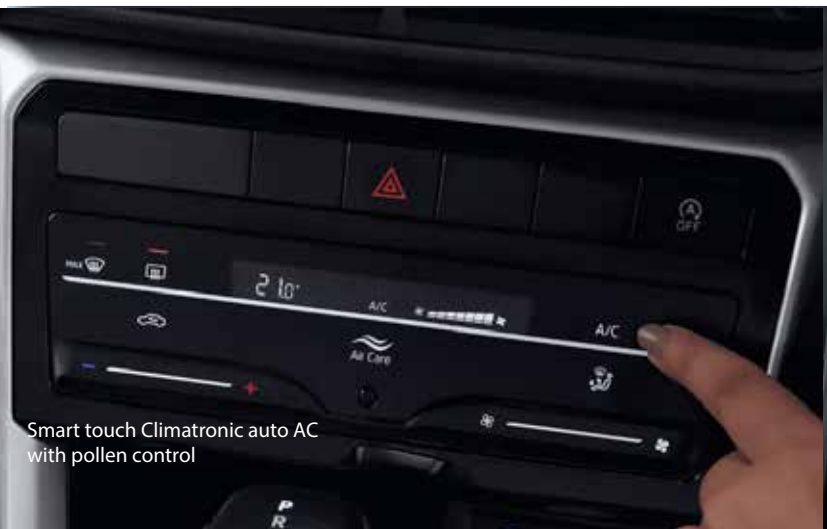
Smart touch Climatronic auto AC with pollen control