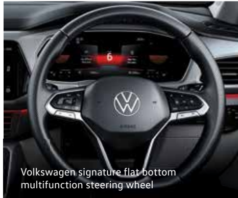
Volkswagen signature flat bottom multifunction steering wheel

The intuitive and thoughtful Taigun helps you play smart to stay ahead in the hustle. The Volkswagen signature flat bottom multi-function steering wheel allows you stay on top of all that drives you ahead. While the Smart touch Climatronic AC and the ventilated seats set the temperature and keep you comfortable in any condition.