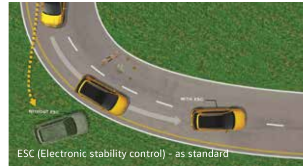
ESC (Electronic stability control) - as standard