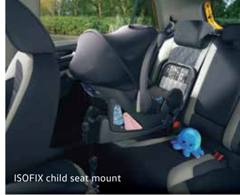
ISOFIX child seat mount