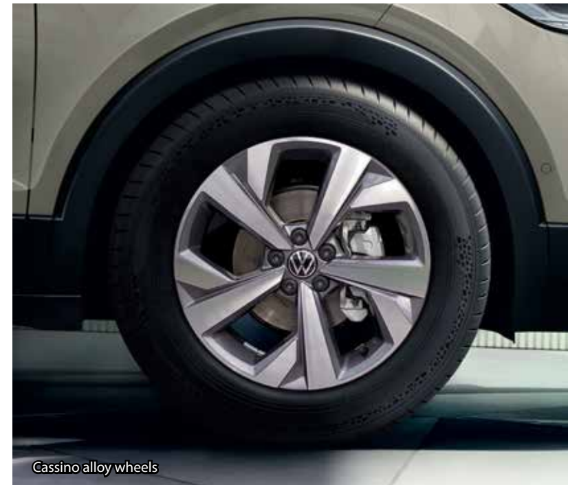
Cassino alloy wheels