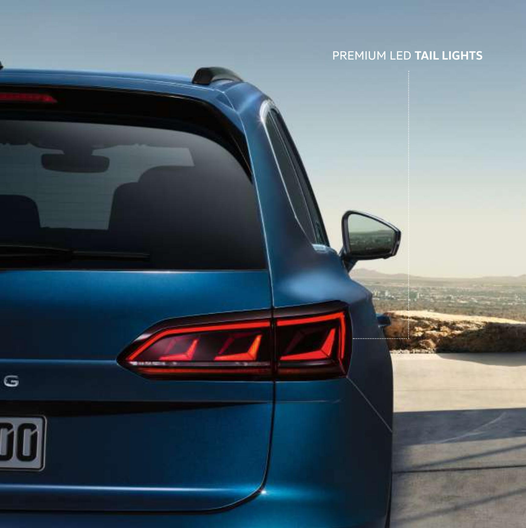
PREMIUM LED TAIL LIGHTS