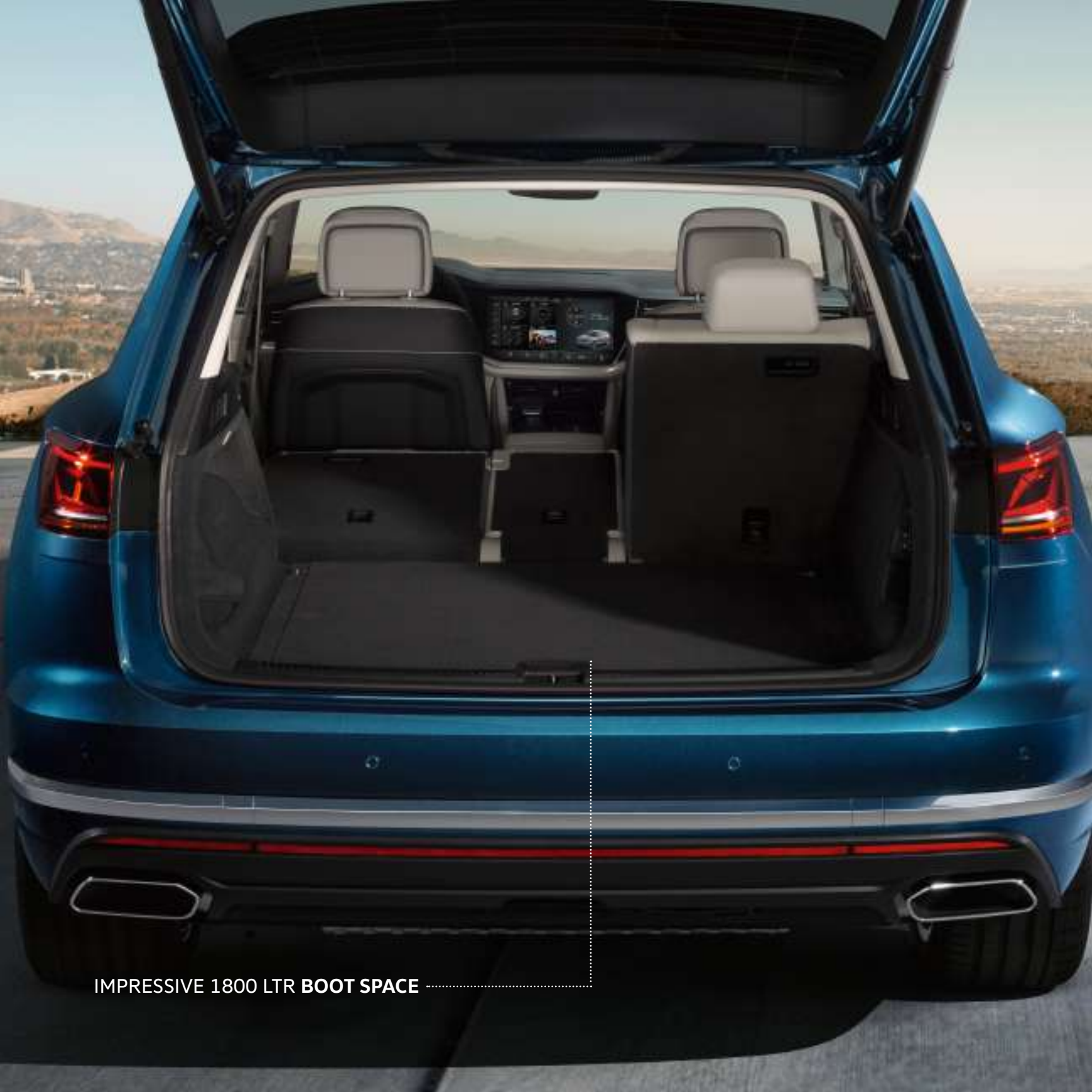
IMPRESSIVE 1800 LTR BOOT SPACE