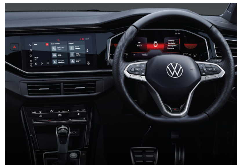
DUAL TONE DASHBOARD